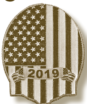
Front of Coin